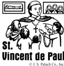
St. Vincent de Paul

This month, through your gifts, the Society of St. Vincent de Paul was able to “bring good news to the poor,” by assisting families with food, utility and rent bills. Thank You! St. Vincent de Paul Society Phone: 412-437-8370